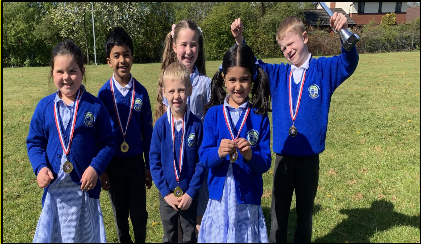
Year 2 Mini Skills Winners!!