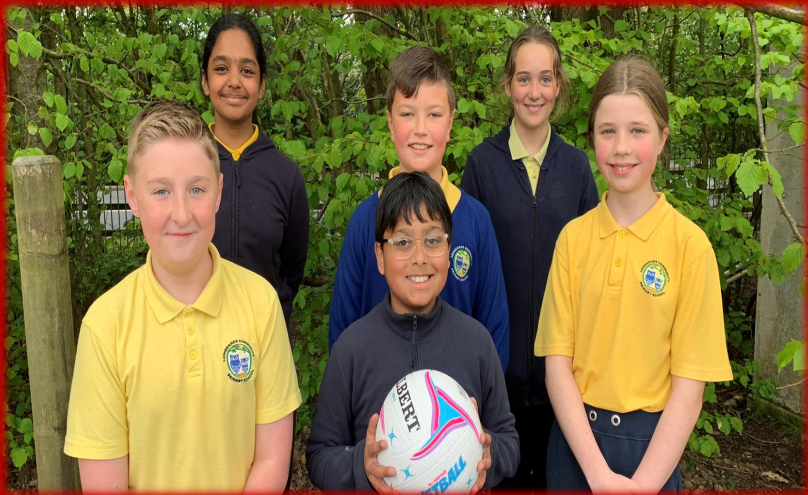
NETBALL AND BASKETBALL SKILLS TEAM