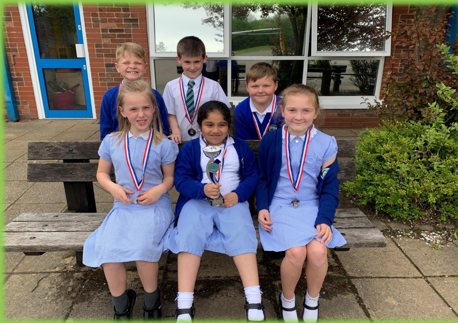
YEAR 3 FOOTBALL SKILLS TEAM