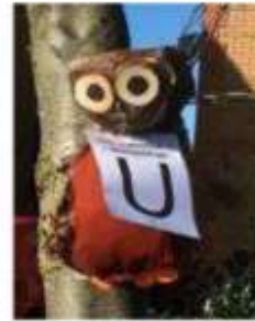
Best Cutest Owl