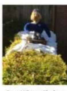
Best Winter Sledger