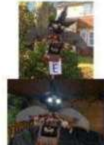
Best Eyes and Wings