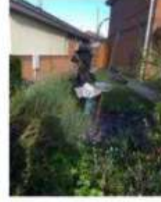
Best in Black