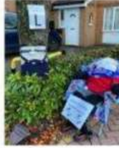
Best in Converting a Minion to become a COVID Safe Football Supporter