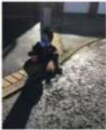
Best in Landing after a Firebolt Technical Fault