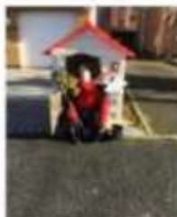
Best Witch in the House