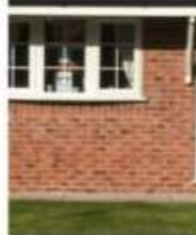
Best Special Appearance