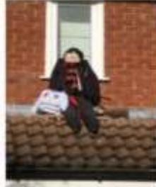
Best in Landing after a Nimbus 2000 Technical Fault