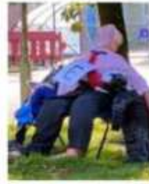
Best in Most Relaxed