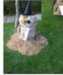
Best in Most Stoic despite needing vet attention