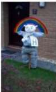
Best Strongest Arms