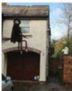
Best Guest Appearances