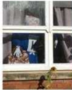
Best Disney Character