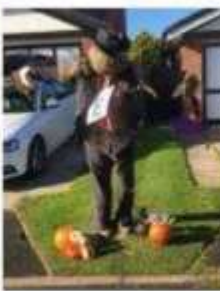
Best Hat and Accessories