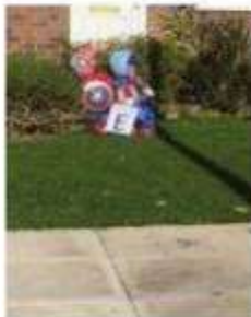
Best Duo Superheroes