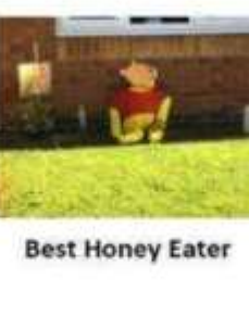
Best Honey Eater