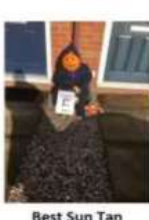
Best Sun Tan