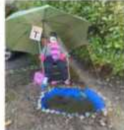
Best in Self Sufficiency