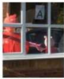
Best Recreation of a Kid's Cartoon Character