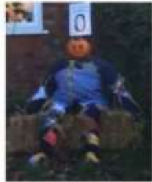
Best Patchwork Leggings