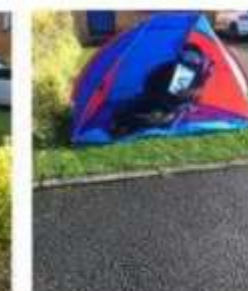
Best Dressed for Winter