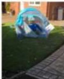
Best in School Uniform