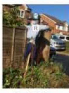
Best in Tallest