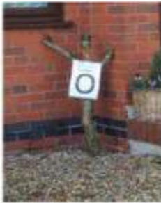
Best Au Natural