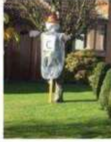
Best Cover Sensibility