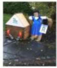
Best in Revenge