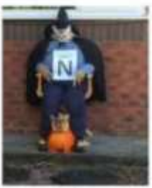
Best in Pet Lookalike