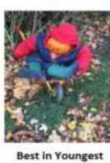
Best in Youngest