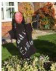
Best Female Vocalist