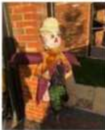
Best Nose and Colourful Trousers