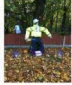
Best Dressed Worker