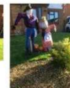
Best Julia Donaldson Characters (Betty O'Barley and Harry Hay)