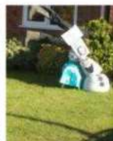
Best In Friends with Legs