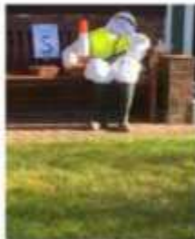
Best in Safety