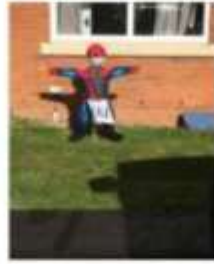
Best Lone Superhero