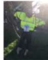
Best in Visibility